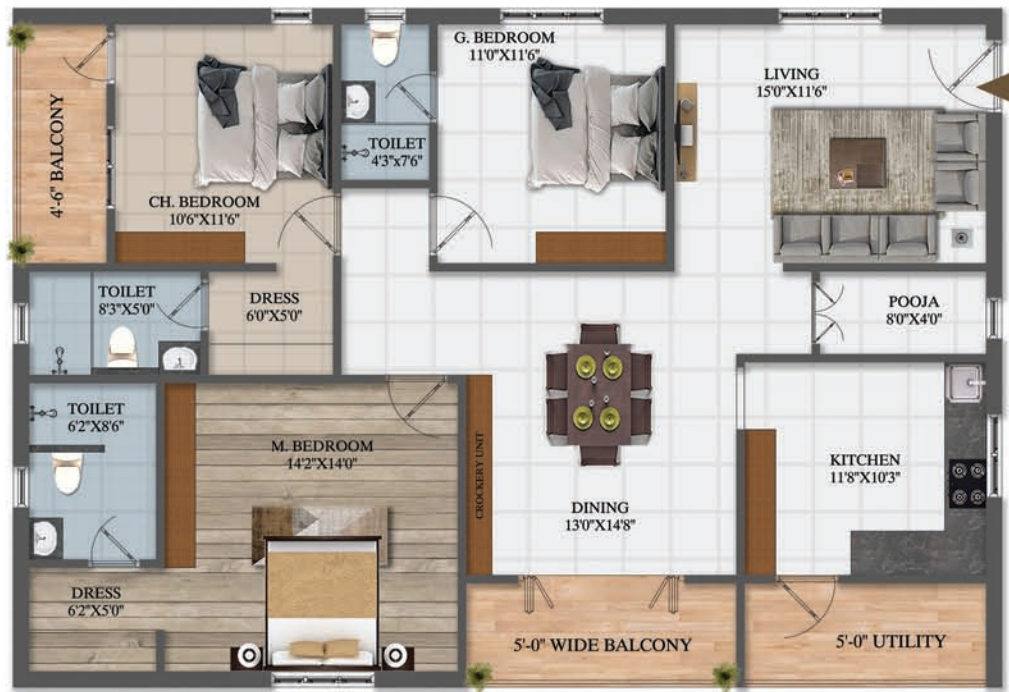
EAST FACING 2015 SFT